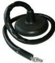
A shock absorbing rubber button seat is suspended by an easy to hold, plastic coated galvanised chain.