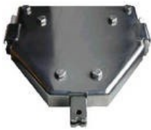
The stainless steel carriage has nylon wheels for quiet running and an automatic brake that keeps it stationary when there is no weight on the seat.