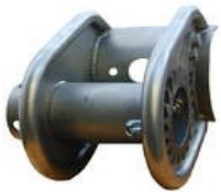
Stainless steel ratchet cable tensioner for easy cable adjustment.